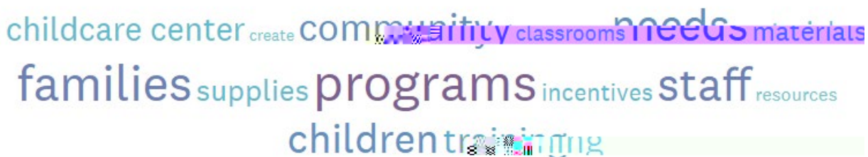
Figure 2. Word cloud for response to “If you had one-time, non-recurring funding, would it be helpful? What would you use it for?”